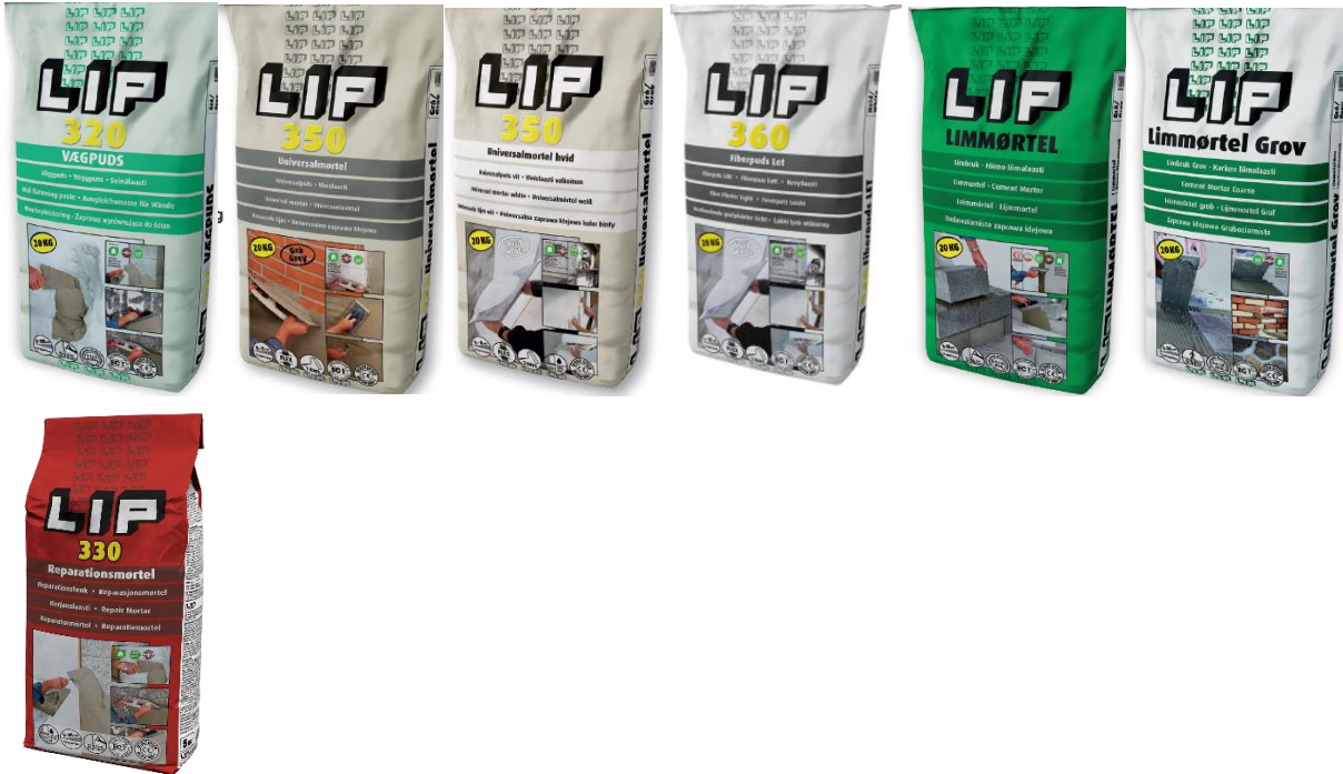
Figure 1: Pictures of the seven LIP wall plaster products covered in this project report.

LIP 320 Wall Plaster, LIP Wall Plaster, LIP 350 Wall Plaster, LIP 360 Wall Plaster Light, LIP Wall Adhesive, LIP Wall adhesive, coarse, LIP 330 Wall Repair Mortar.